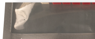
+ Above and below - examples of the broad textured seal produced by the Shawseal.